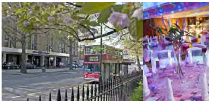
Hilton London Kensington hotel

Hilton London Kensington hotel 179-199 Holland Park Avenue London, United Kingdom W11 4UL